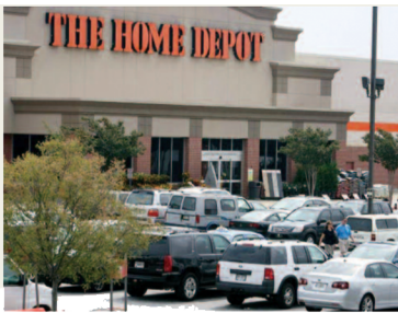
The Home Depot