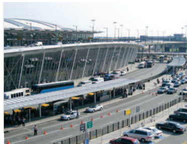
JFK Airport - Terminal 4