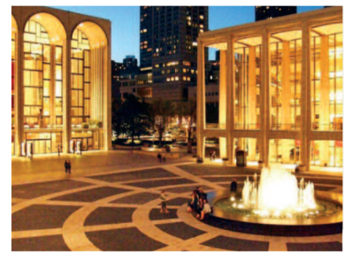
Lincoln Center, New York City